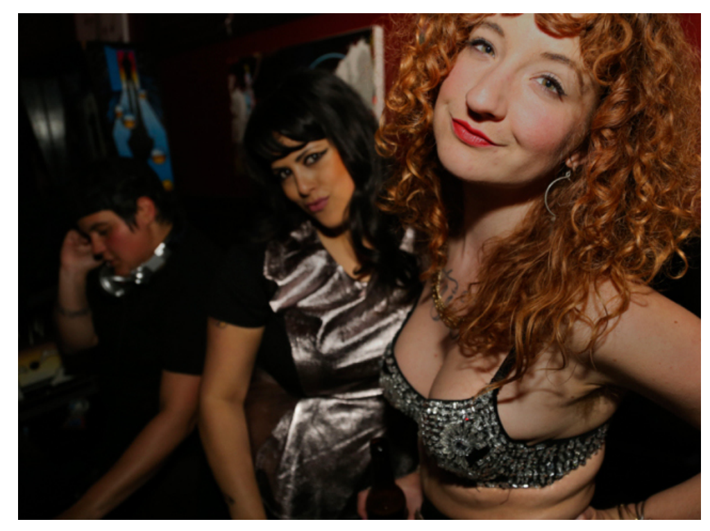
Regulars at The Lex: The iconic club is closing, another sign of the times

Why SF's iconic dyke bar, the Lexington Club, is closing