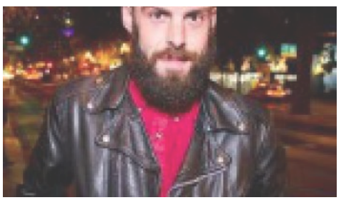
Tom's Town: My Bay Marriage weekend With 2 comments

This entry was posted in Uncategorized. Bookmark the permalink