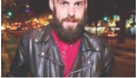
Tom's Town: Drag Queens and Politicos Similar post