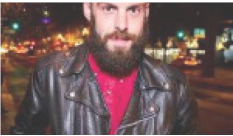
Tom's Town, Pride Edition: The struggles past, present, and future Similar post